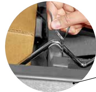
Mattress Retainer Brackets Kit (1)