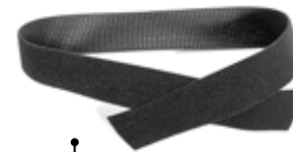
Connecting Strap (1) (Only included with Twin XL and Split Cal King)