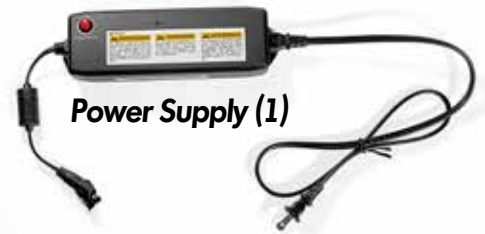
Power Supply (1)