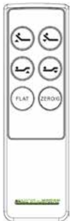
Remote Control with AAA Batteries (1)

ALL ELECTRONICS AND COMPONENTS THAT NEED TO BE INSTALLED ARE LOCATED IN BOXES UNDER THE BASE OR ATTACHED TO THE ADJUSTABLE BED FRAME.