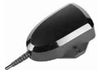
Bluetooth Module (Optional) To control adjustable bed remotely with your smart device.

When using your own headboard: Plain screwdriver and a 7/16" wrench