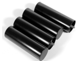
8" Legs (Qty. 4)