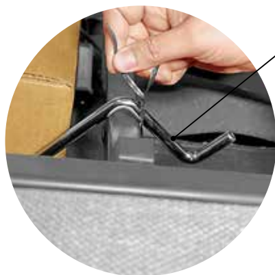
Mattress Retainer Brackets Kit (1)

Note: the 8" legs are (2) 4" legs combined. If you prefer a low profile bed you may remove the 4" top section.