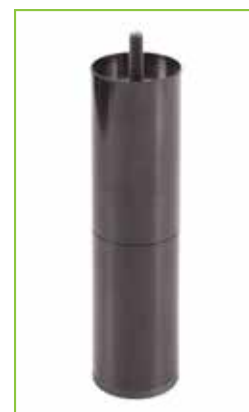
8" Legs (Qty. 4)

Note: the 8" legs are (2) 4" legs combined. If you prefer a low profile bed you may remove the 4" top section.