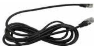
Sync Cable (1) (Only included with Twin XL and Split Cal King)