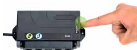
Control Box Base #1

An example would be if you previously programmed your two control boxes to work together but now you want them to operate independently.