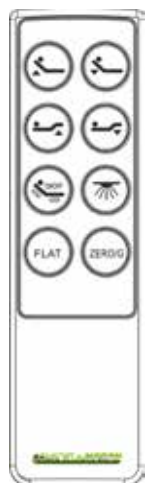
Remote Control with AAA Batteries (1)

ALL ELECTRONICS AND COMPONENTS THAT NEED TO BE INSTALLED ARE LOCATED IN BOXES UNDER THE BASE OR ATTACHED TO THE ADJUSTABLE BED FRAME.