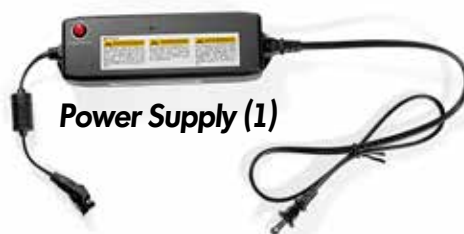
Power Supply (1)