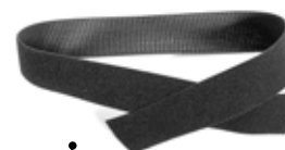
Connecting Strap (1) (Only included with Twin XL and Split Cal King)